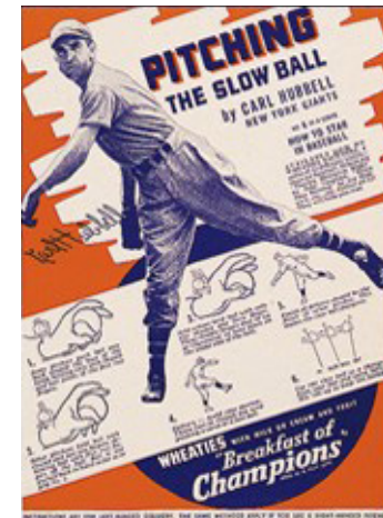
Carl Hubbell: 1938 Baseball

Wheaties broadcasts also led to the film career of Ronald “Dutch” Reagan, a sportscaster from Des Moines, Iowa, who made play-by-play re-creations of Chicago Cubs games using telegraph reports. In 1937, Reagan was voted the most popular Wheaties announcer in the country and was awarded a trip to the Cubs’ spring training camp in California. While there, he took a Warner Brothers screen test and subsequently became a popular film star. He later went into politics and became the 40th president of the United States.